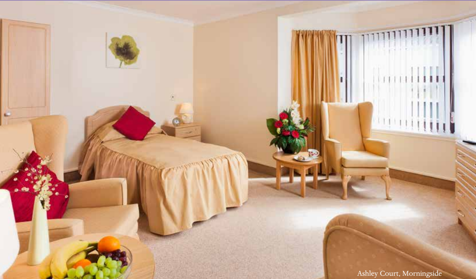
Ashley Court, Morningside

Ashley Court Nursing Home in Morningside is a beautiful residence that opened in 1995. By offering en-suite facilities for all rooms (some with showers), it led the way for nursing homes in the UK.